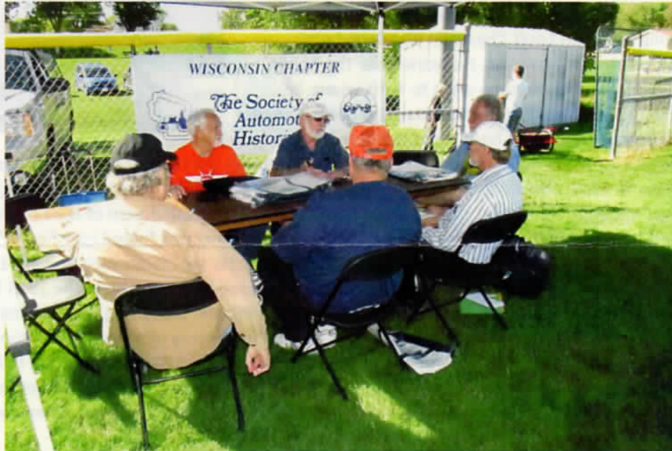
During a 'Group Staring Contest' Wisconsin Society of Automotive Historians inadvertently devised strategies to disseminate Automotive History