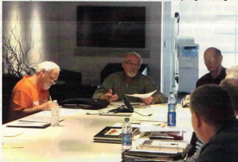
Our "Illustrious Leader" conveyed creative methods of advancing/promoting/generating interest in Automotive History