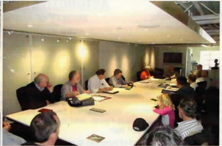
With Membership of the Wisconsin Society of Automotive Historians assembled at the Spring Meeting 'Waiting for Enlightening Knowledge'