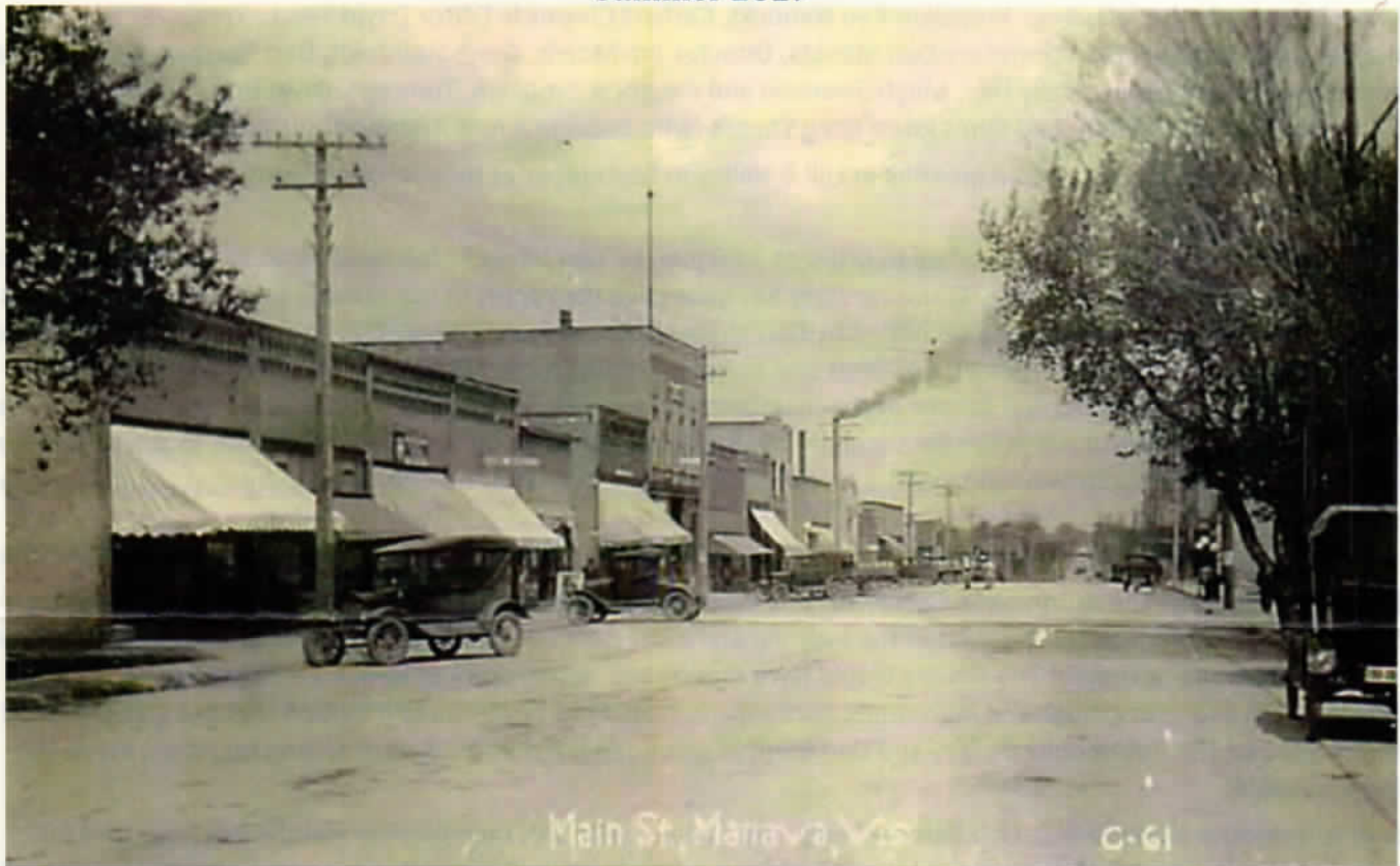
Main Street [Manawa, Wisconsin] – 1920's