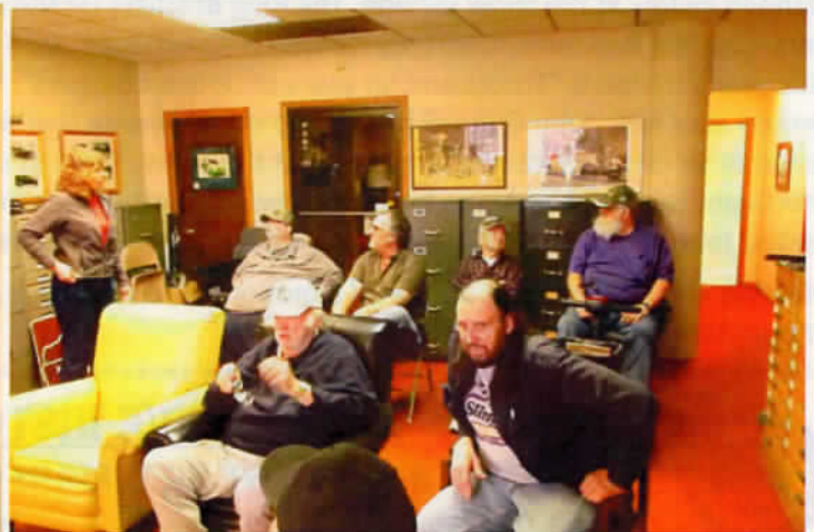
While Membership of the Wisconsin Society of Automotive Historians gathered for the Spring Meeting 'Ready & Eager to Jump Right In'