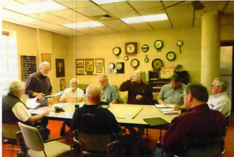
Some on the Board continuously 'Toasted to the Success of the Proceedings'