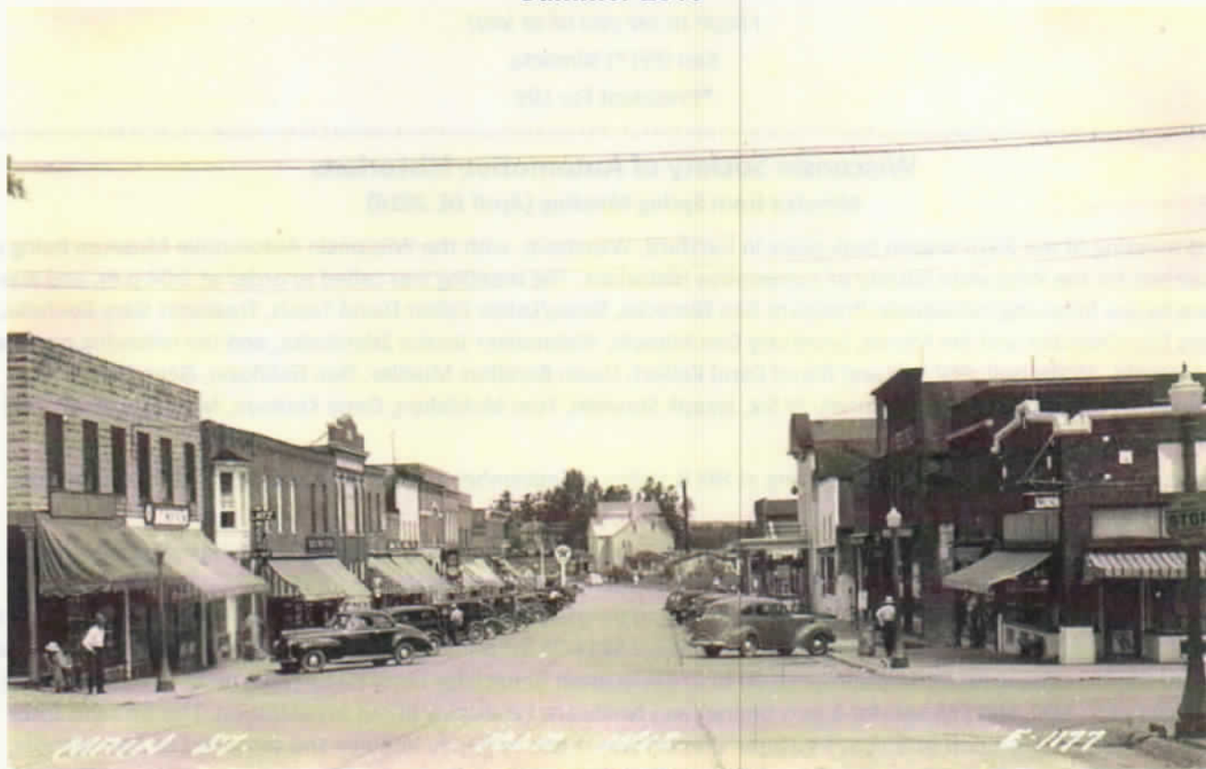
Main Street [Iola, Wisconsin] – 1930's