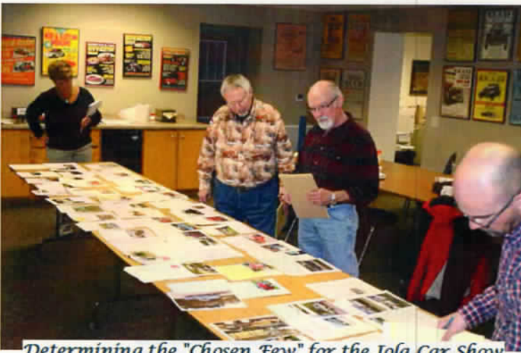
Determining the "Chosen Few" for the Iola Car Show

Friday and Saturday will be much the same as Thursday, except that many of the participants will already know where to park, so the workload subsides quite a bit. However, there is usually more sales activity at the table.